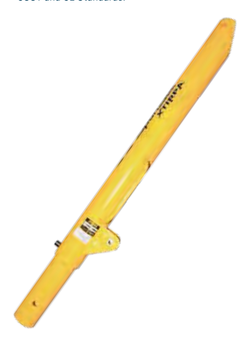
SPXTIN2003 - Davit Mast

The combination of davit arm and mast allows the operator to pivot the system for easier and safer rescue. Durable and versatile, the system has a capacity of 164kg and has a safety factor of 10:1 and meets or exceeds CSA, ANSI, OSHA, CSST and CE Standards.