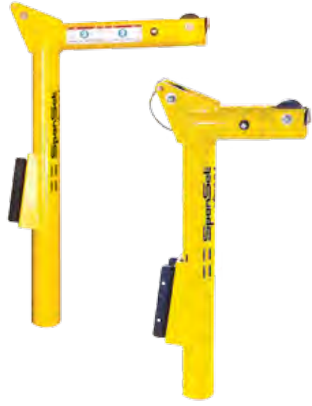
SPXTIN2363 Short Reach Mast and Davit