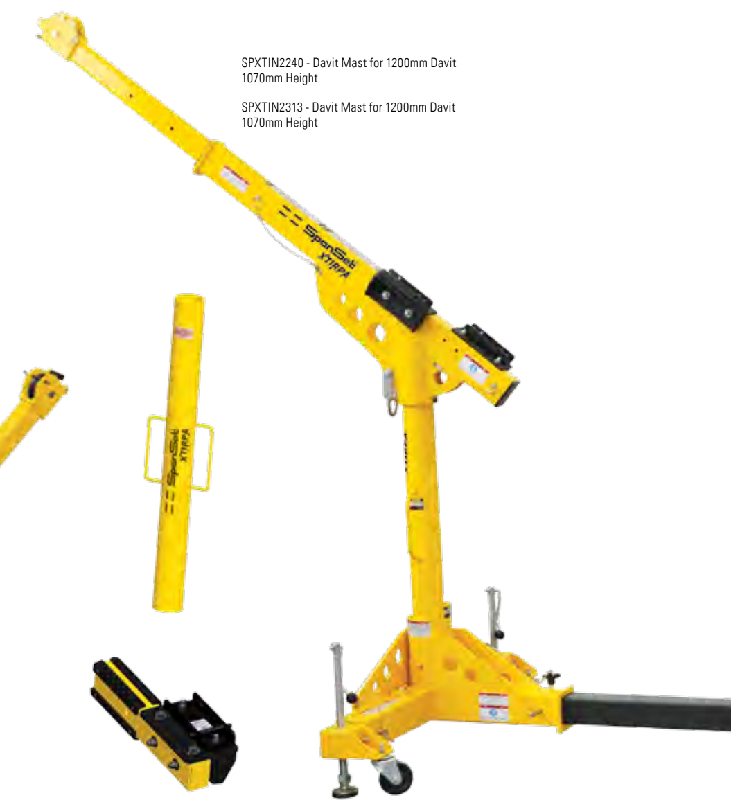
SPXTA2237-06 - Removable Adapter for Positioning Winch

SPXTIN2237 - Extendable Arm for 1200mm Davit