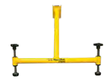
SPXTIN2108-18 - Stabiliser for 1060mm Portable Manhole Guard