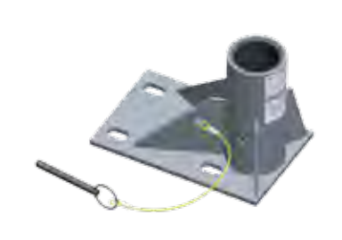
SPXTIN2005 - Stainless Steel Floor Adapter