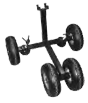
SPXTIN52 - Manhole Guard Repositioning Wheels